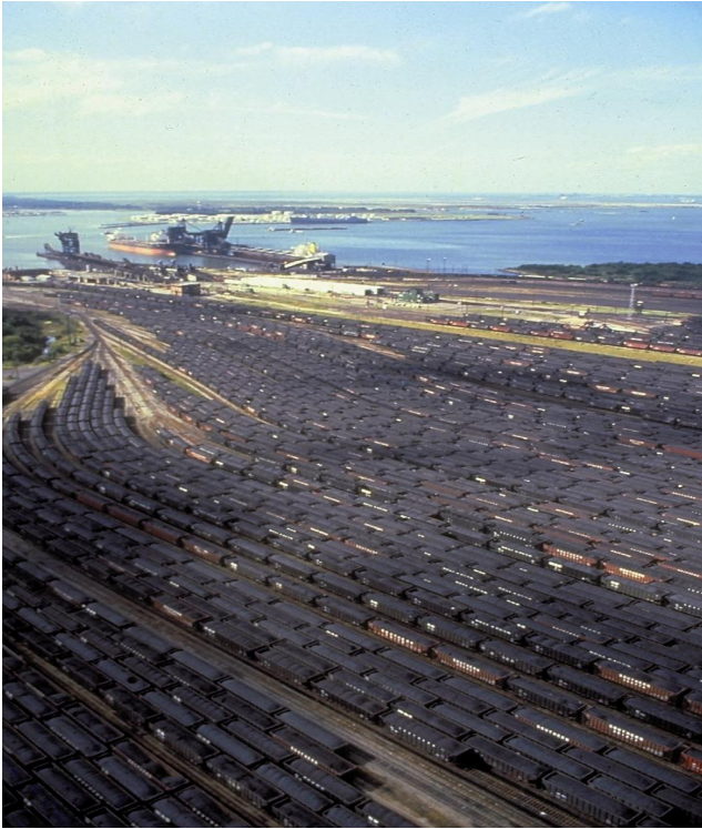
Norfolk Southern Pier 6, Norfolk, Virginia, Port of Hampton Roads.