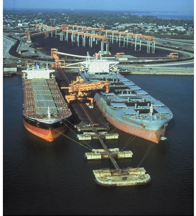
Pier IX Terminal, Newport News, Virginia, Port of Hampton Roads.