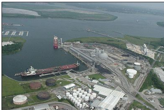
Shipyard River Terminal, Charleston, South Carolina